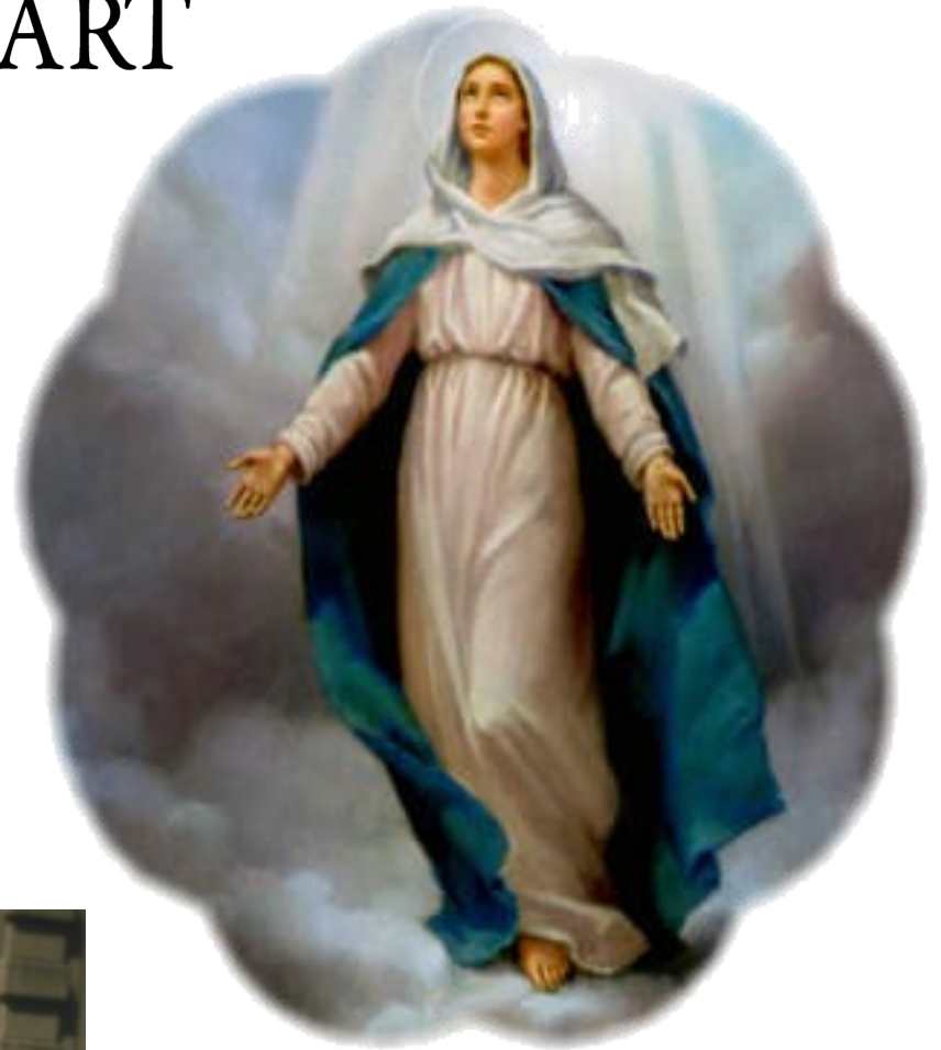
The Assumption of Mary into Heaven